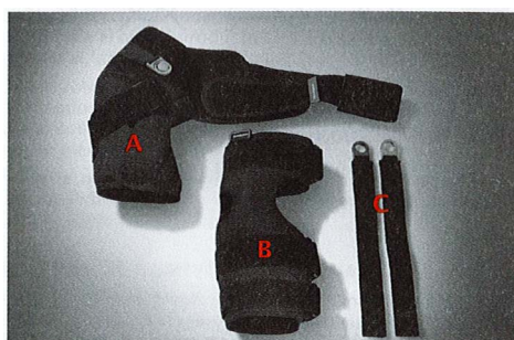
Components of NEURO-LUX® II